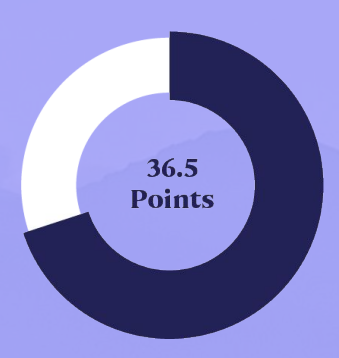
Our Workers Score