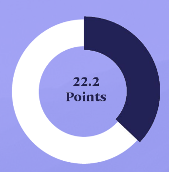
Industry Average Score